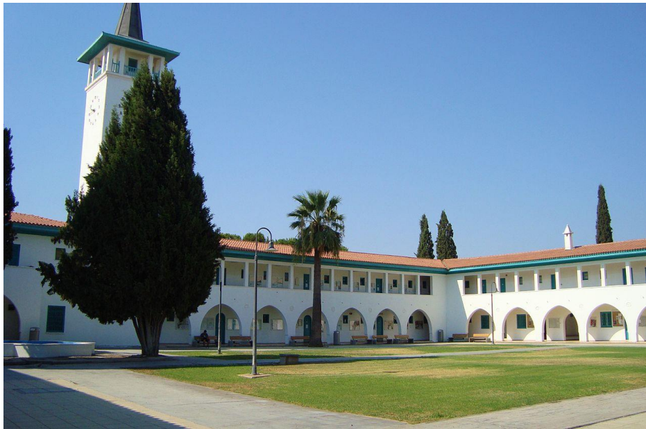
Main University square of the old campus