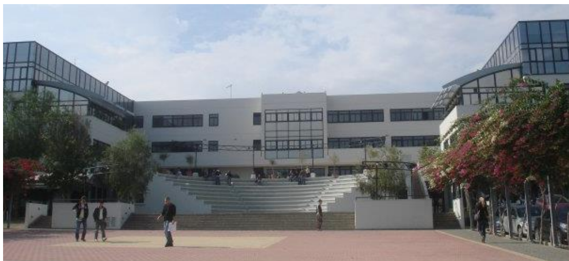
University of Nicosia

Private universities in Cyprus were first accredited in 2005 . Today, there are five private universities and many Collages.